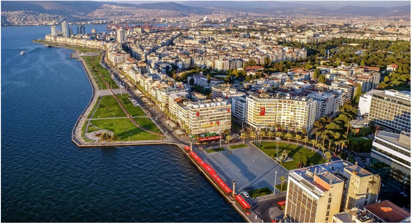
Kordon waterfront, Aegean Sea