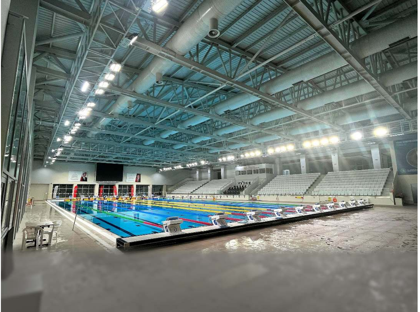
Spectator tribune and timing wall

The facility includes a 10-lane, 50-metre Olympic swimming pool designed for training and competition. Inside the complex there is also a diving pool, a spectator tribune, and a modern video scoreboard that allows races and results to be followed clearly during competitions. Athlete rest areas and a cafeteria provide a comfortable environment for athletes, teams and visitors throughout the event.