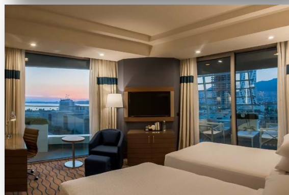
Comfortable rooms designed for team accommodation