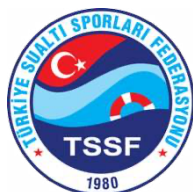
TSSF Türkiye Underwater Sports Federation