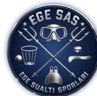
Ege Underwater Sports Hosting Club